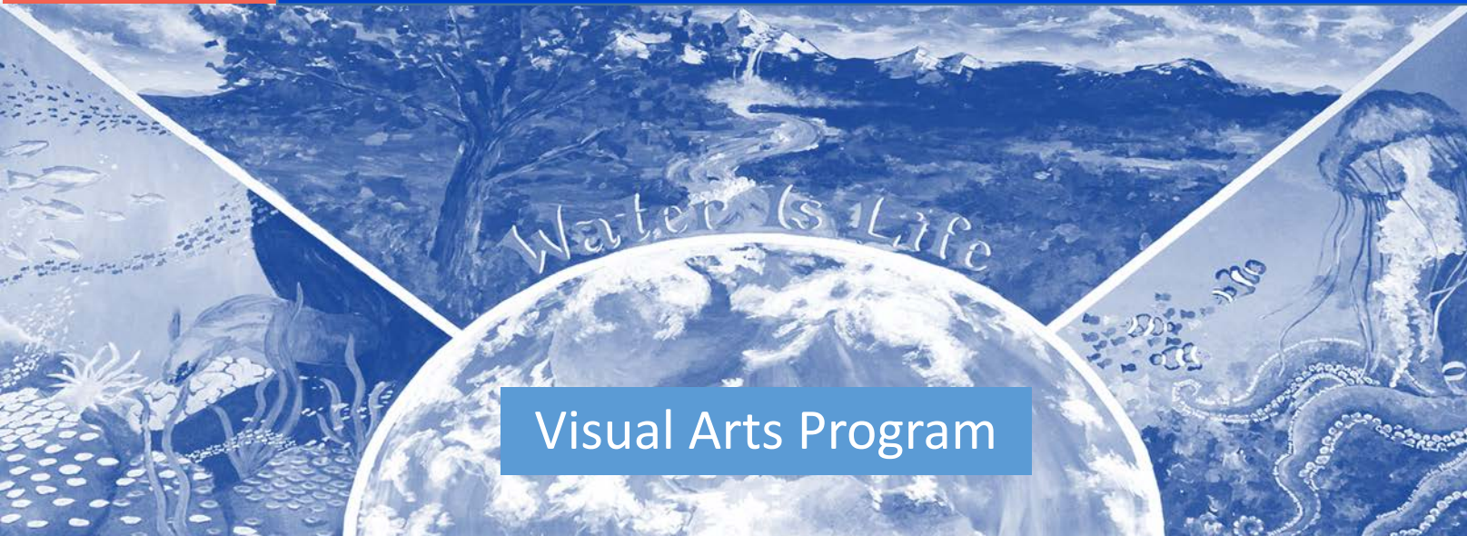
Visual Arts Program