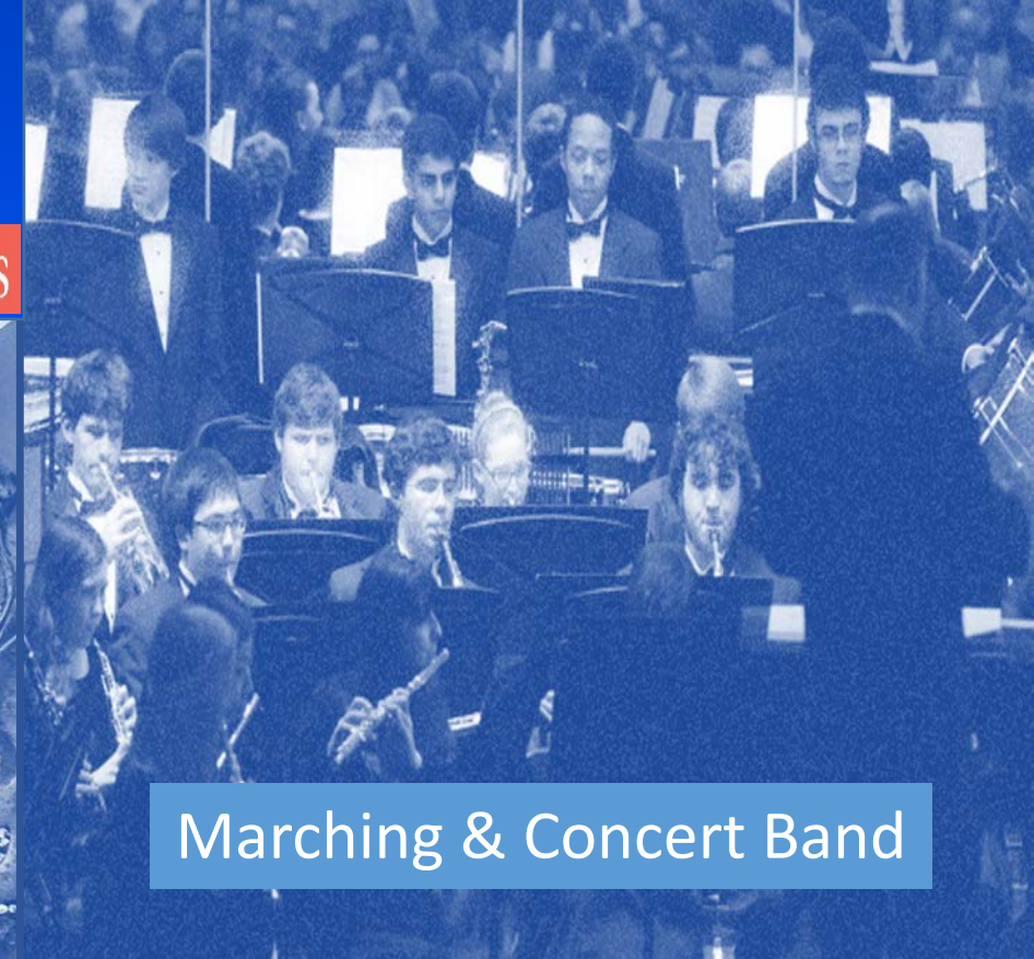
Marching & Concert Band